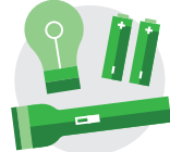
Torch with spare batteries