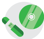
Copies of important documents