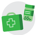
First Aid kit and medications