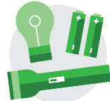
Torch with spare batteries