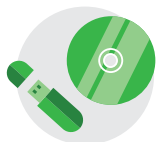
Copies of important documents