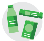
Food and water